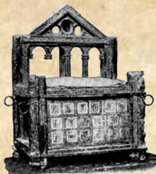
CHAIR OF ST. PETER (VATICAN BASILICA)

This week we celebrate the Feast of the Chair of St. Peter on February 22. In St. Peter's Basilica in Rome there is a wooden chair encased in bronze which is venerated as the chair of St. Peter. Archaeological study suggests that it does not date back to the time of St. Peter, but it still serves, in the words of Pope Benedict XVI, as "a symbol of the special mission of Peter and his Successors to tend Christ's flock, keeping it united in faith and in charity." Prelates traditionally sit to preach and teach, so this feast is one on which we honor and thank God for the office of St. Peter and his successors, the Popes, as guarantor of the unity of the Church