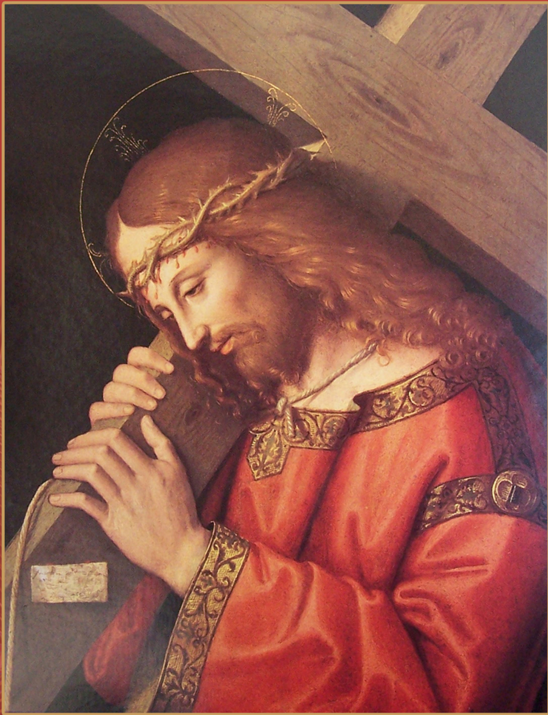
Marco Palmezzano / 1535